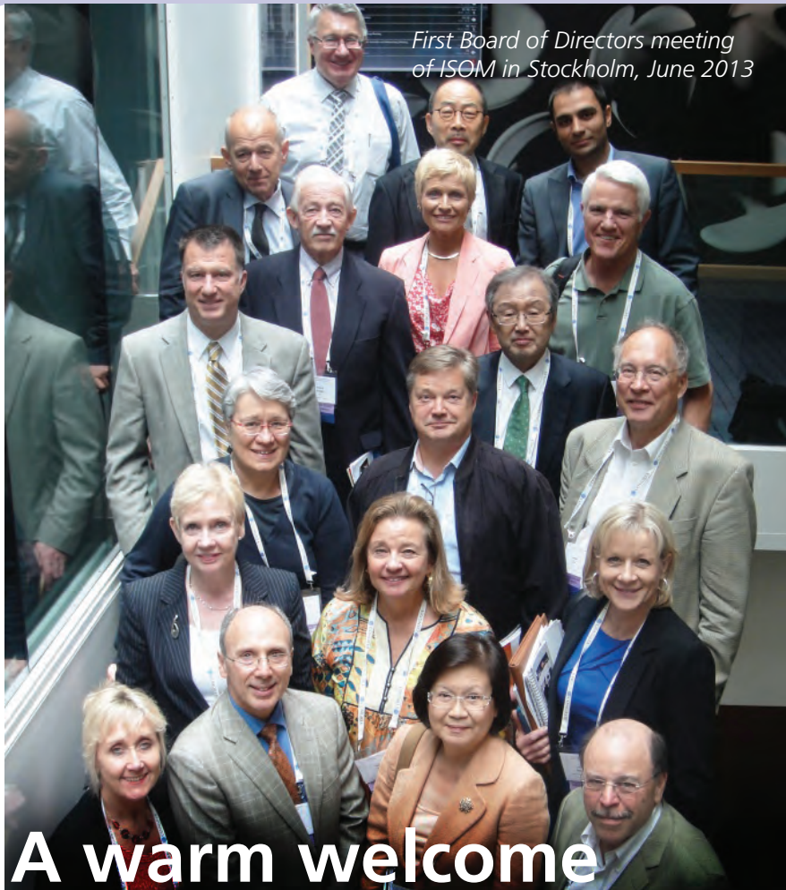
First Board of Directors meeting of ISOM in Stockholm, June 2013